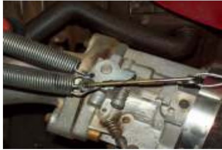
Photo 2: Notice that the springs are attached to the same bracket this is incorrect! They must be mounted on two separate mounting brackets. This way if for any reason one breaks you will still have one spring attached.

Photo 1: This is the correct way to attach the throttle return springs on the carburetor Notice they are mounted on two different Locations and not together;